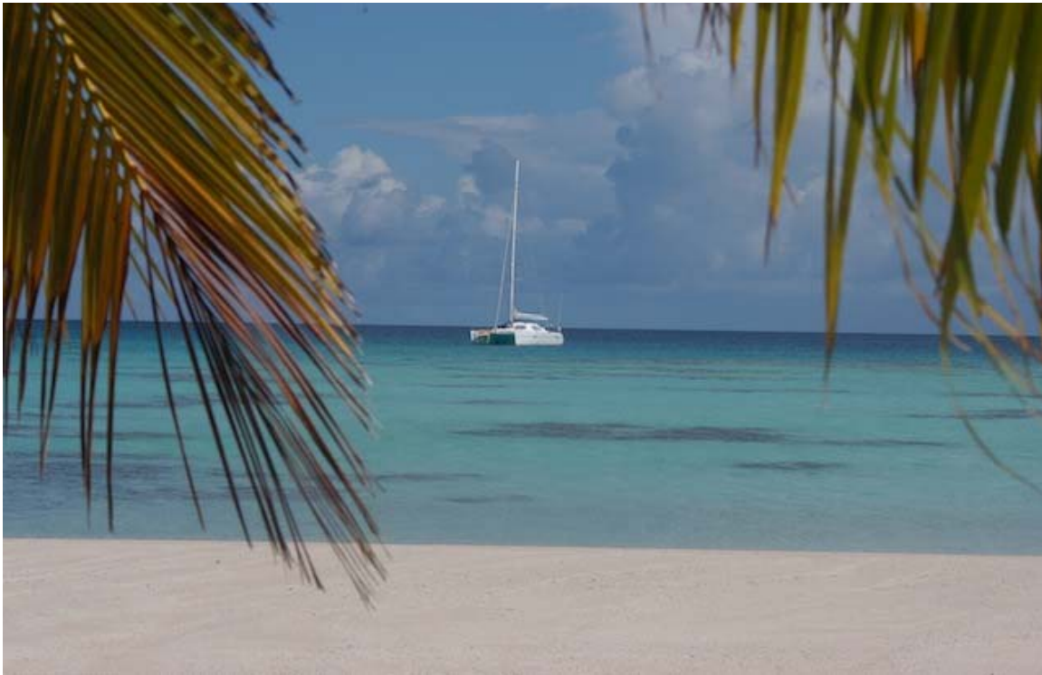
Tuamotus, French Polynesia